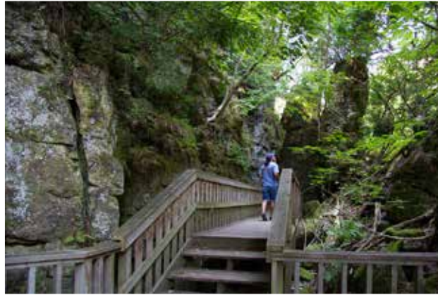
Terra Nova / River Road Area